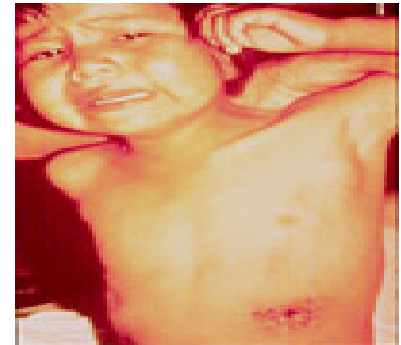
Necrotic ulcer- plague