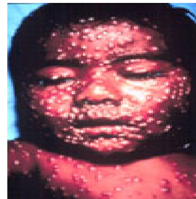
Variola Major “Smallpox”